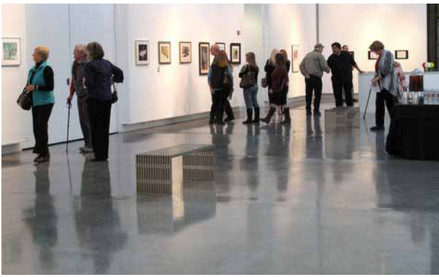
Additional Pictures from November's meeting (last page) and pictures from Fall Show (this page)