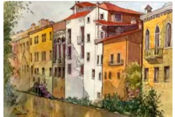
Second Place ”Reflections in the Shadows of Venice” by Ed Klein