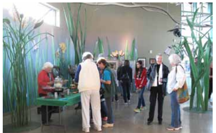
Pictures from the Signature Show at Wetlands Park. Thanks to Myra Oberman