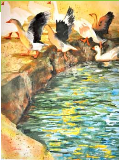
Best of Show