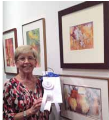
Third Place End of Summer by Grace Kent