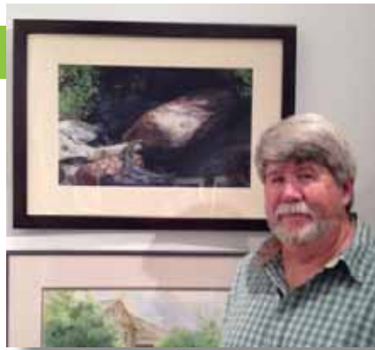
First Place One Fine Day in Lizard Canyon by David Mazur