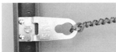
screw in hanger